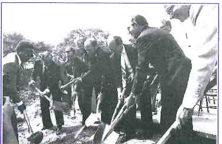
Participants dig in at Amity Villas site