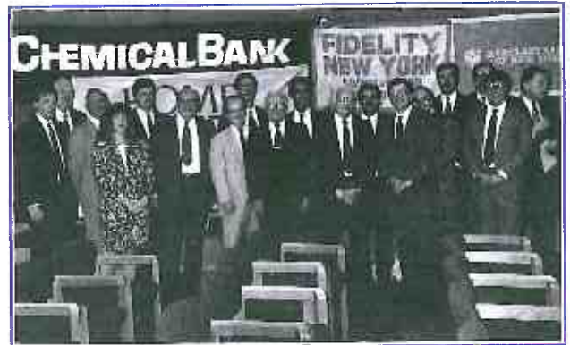
Participants gather at the announcement of the Long Island Housing Partnership Regional Lending Consortium

In the lending consortium, participants will share the risk and will be able, as a group, to participate in a broader range of projects than they would undertake individually. Projects for low and moderate income families and communities will be emphasized.