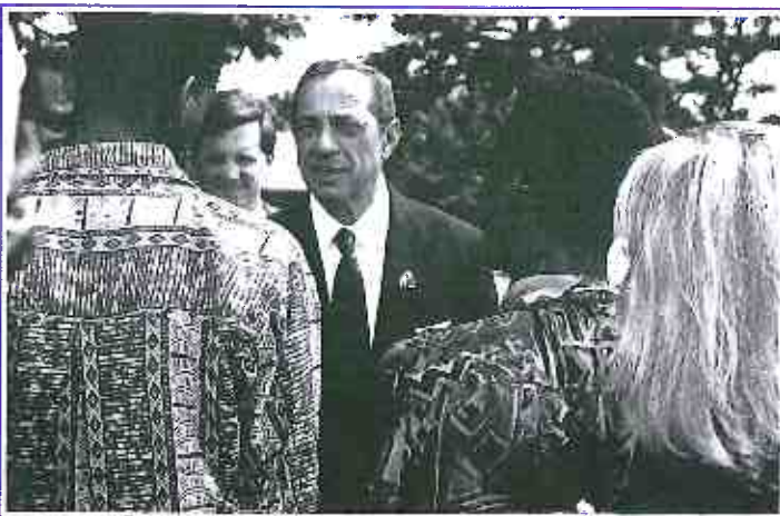
Governor Cuomo meets homeowner hopefuls