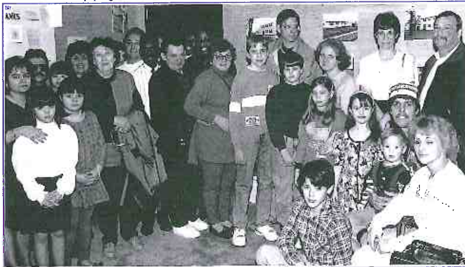
Some of LIHP's first-time homeowner families join LIHP in celebration

In celebration, LIHP, many of the homeowners, New York State, Suffolk County and Islip dignitaries gathered at LIHP's office on January 24, 1992. The joy of the new homeowners and their children filled all in attendance with the satisfaction of knowing that all the work involved in the programs was worth it.