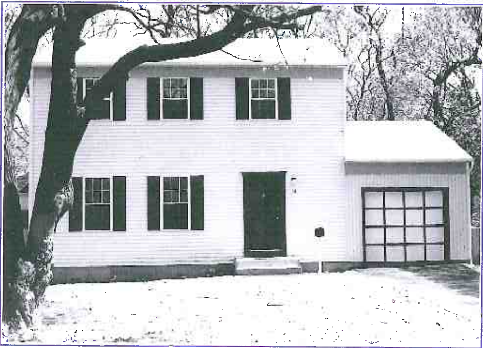
LIHP Colonial in Brentwood