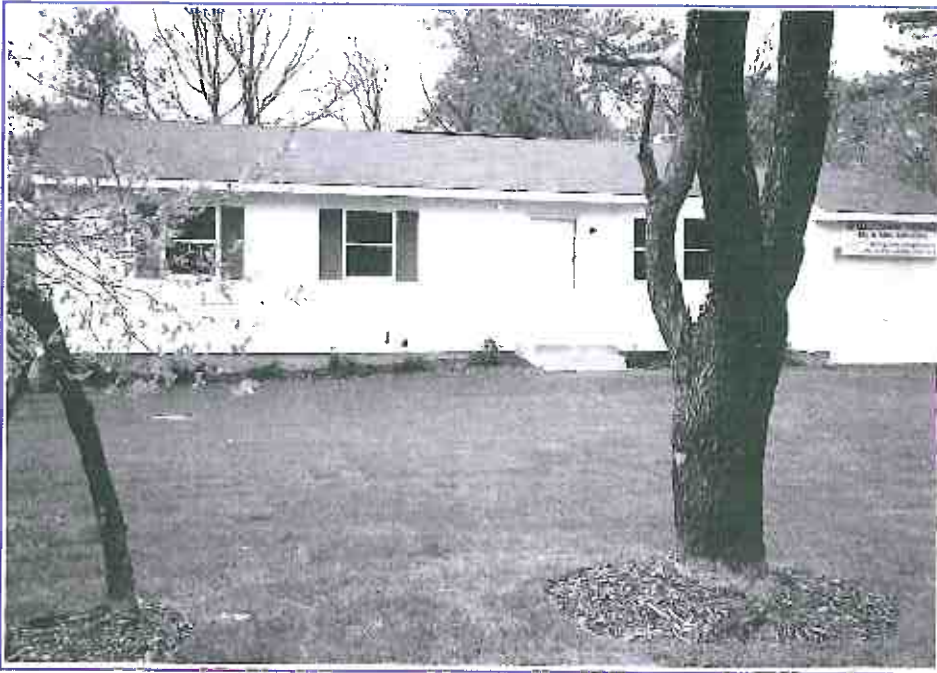
LIHP Ranch in Central Islip