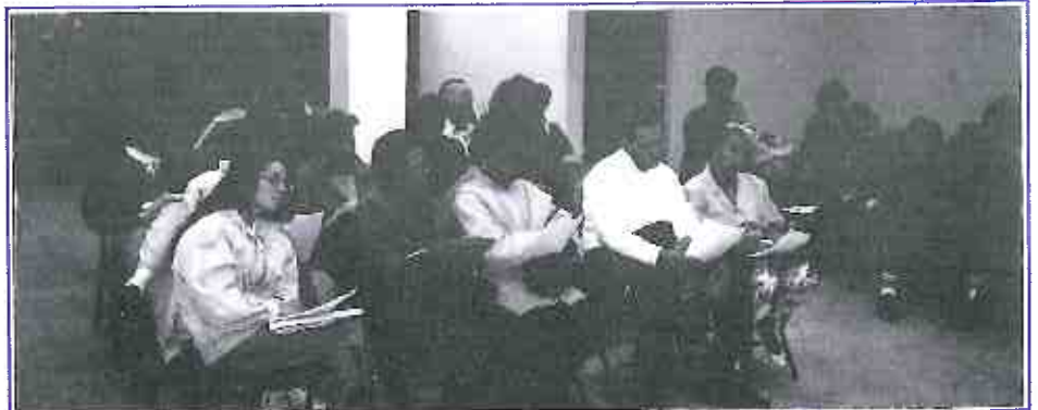
Hopeful new homeowners listen at LIHP Mortgage Seminar

The recession and uncertain employment prospects are making the job of obtaining mortgage commitments for LIHP's home buyers more difficult. But LIHP's staff, with the expertise, support and help of LIHP member-banks, is conveying the message of fiscal responsibility to those who aspire to home ownership on Long Island.